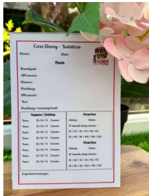
This booklet is reviewed and updated as and when necessary